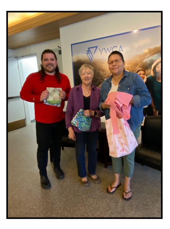
Accessory bags were sewn by Lodge members and taken to Harbour House.