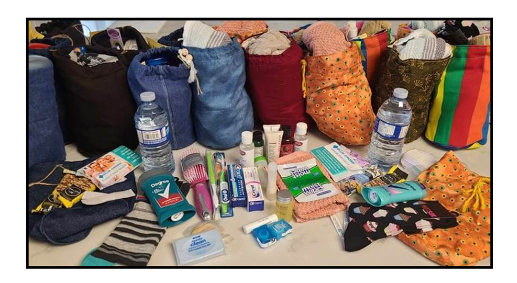
Blessing Bags are stuffed full of items shown in front of the bags.